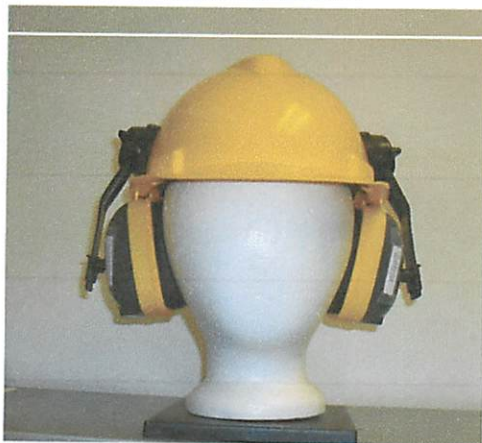
Test Item: Q2997A

These data were obtained through measurements made at the laboratories of Michael & Associates, Inc., State College, PA, USA. Michael & Associates, Inc., is accredited to test to ANSI S3.19-1974, ANSI S12.6-2008, ANSI S12.42-2010, EN352 parts 1-8 and AS/NZ S1270:2002 by the National Institute of Standards and Technology (NIST) National Voluntary Laboratory Accreditation Program (NVLAP).